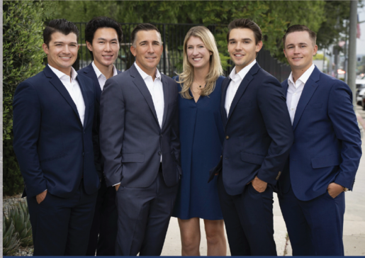
Ballard Real Estate Group, Brokered by eXp Realty